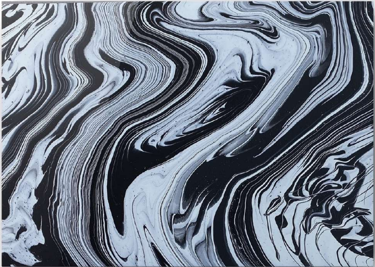
#2 Monochrome Flow Pamela Hansen